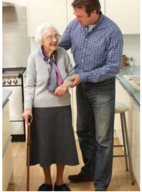
Respite stays available in assisted living and skilled nursing