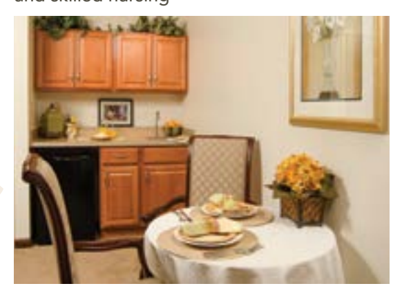
Assisted living suite kitchenette and dining areas