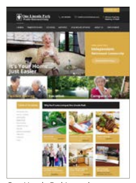
One Lincoln Park's new home page