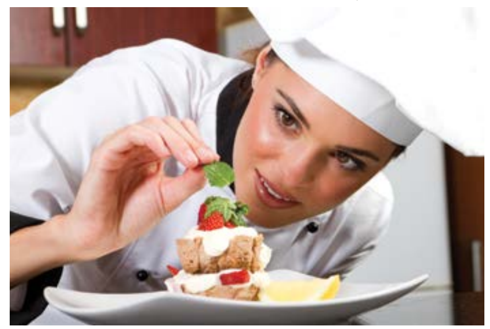
Residents rave about our homemade menu options.