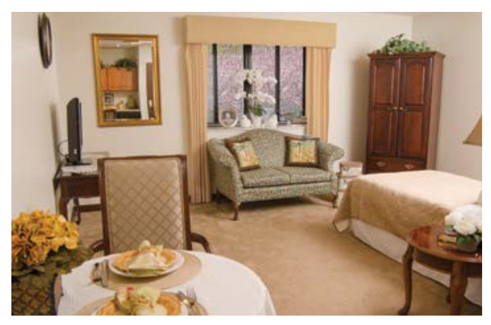
A private assisted living suite at Lincoln Park Manor

Private Assisted Living suites offer ample space to include your own furnishings. Two floor plans are available: one includes a small kitchenette area that has a mini-refrigerator, cupboard space and small sink or you can select a room that has a custom built-in closet. Every room also features a private bathroom with walk-in shower.